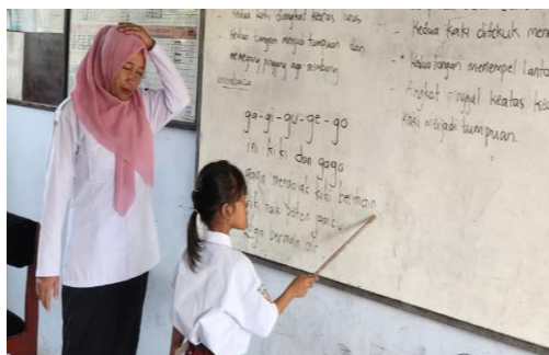
Figure 1. Student Read Sentences

oral tests and written tests. The teacher stated that the initial reading and writing skills of grade 1 students at SDN Mlaten 1 were relatively good, there were only 2 students who had low MMP abilities. More than 90% of students are proficient at reading, but there are still many students who still experience difficulties and are unable to write at the beginning. This can also be seen from the results of observations when learning activities take place. Students are able and fluent when asked by the teacher to read the sentences on the board.