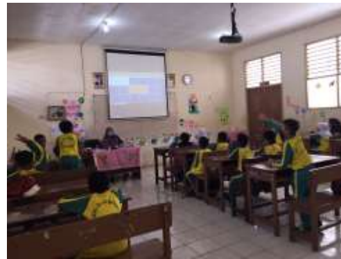
Figure 2. Learning Situations When Students Are Actively Involved In Games On The Bamboozle Website

Learning with game-based learning models has advantages including: The advantages of Game-Based Learning include: (1) Interactive, fun and trains collaboration and new thinking, (2) Facilitates the learning stage because it can relieve stress, (3) Has its own charm to learn and gets good feedback. fun and useful, (4) Can measure the level of understanding, train memory, relax after learning, and trigger enthusiasm for learning